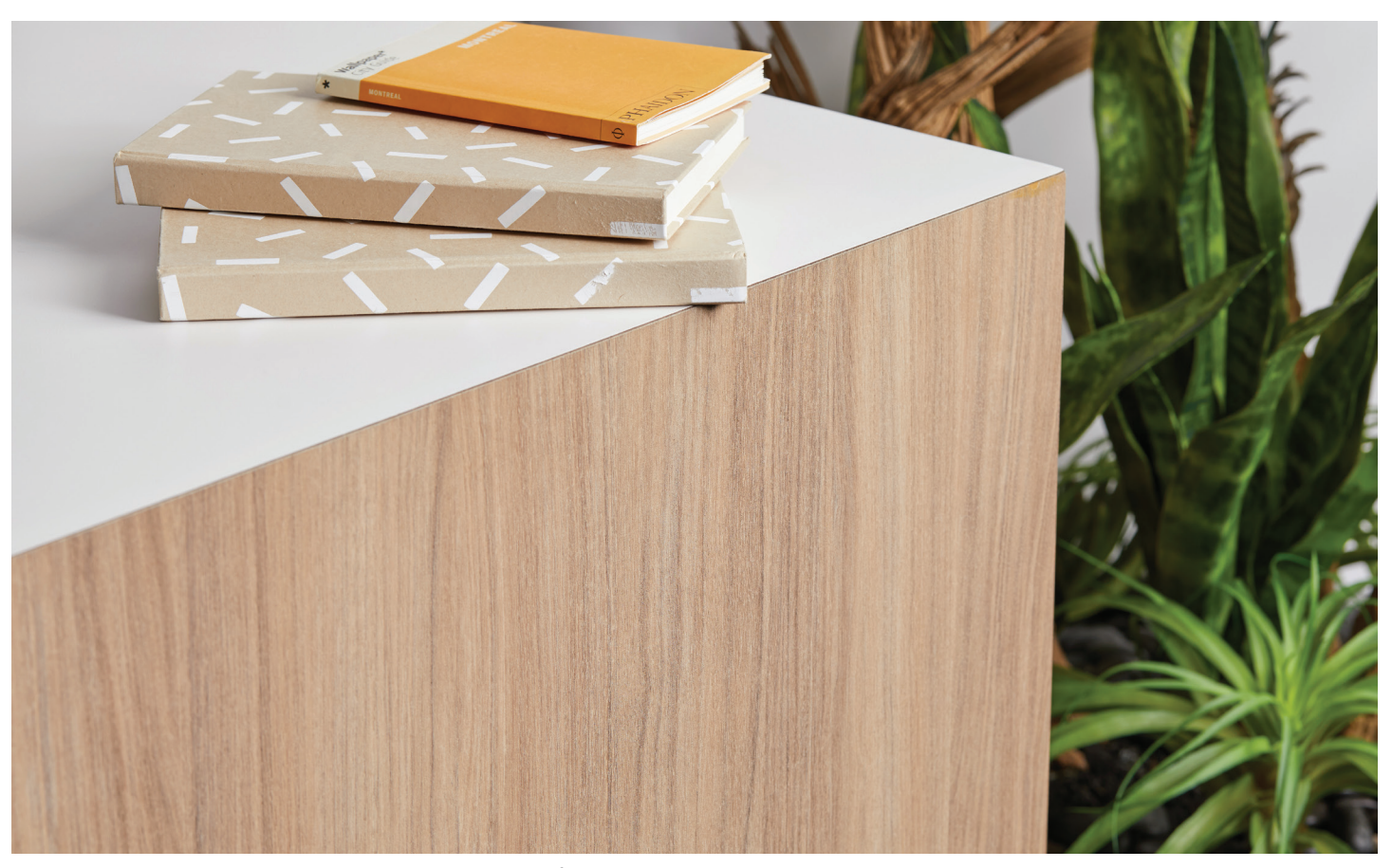
Arborite's Uptown Urban Walnut (W474) shown here with LE finish