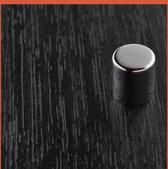
The LE woodgrain finish adds elegance, depth and dimension to woodgrains.

Finishes greatly enhance laminates, creating a more luxurious or realistic feel. Responding to industry trends, we added two new and sophisticated tactile textures to our collection of finishes.